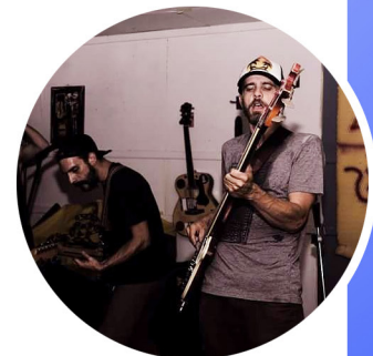
— 18 — City Creeps