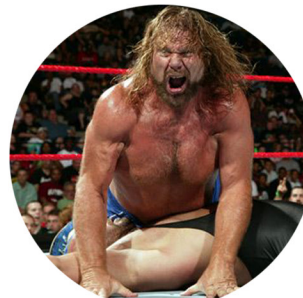
— 17 — Pro Wrestling Hall of Fame