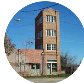
— 16 — Little Skyscraper