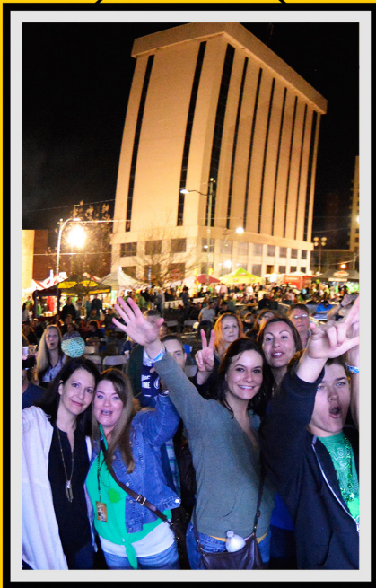
St. Patrick's Day Festival March 11