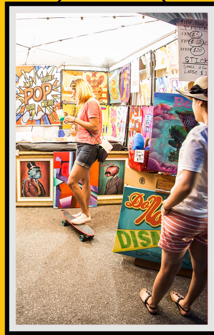
Art & Soul Festival June 24