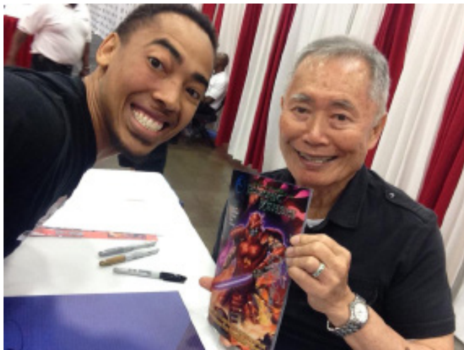
George Takei, Hikaru Sulu from Star Trek

pages. So, we decided to get together. There were four of us. Me, the letterer, and then a penciler, an inker, and colorist. We all decided to get together and create something. I took that &@*# seriously. I took out loans and put my money where my heart is. The other guys have their own thing going on, but this is all I do. But that's how it came about, four friends com-