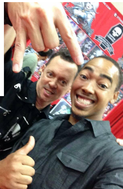
Brian Pulido, creator of Lady Death

alive. I love Marvel, but the indie stuff, you can get so much more out of an indie comic than you can a mainstream, cookie cutter kind of book. They usually just have the same characters doing the same thing over and over again. It's repetitious. But one of our books, "Send In The Clowns", is