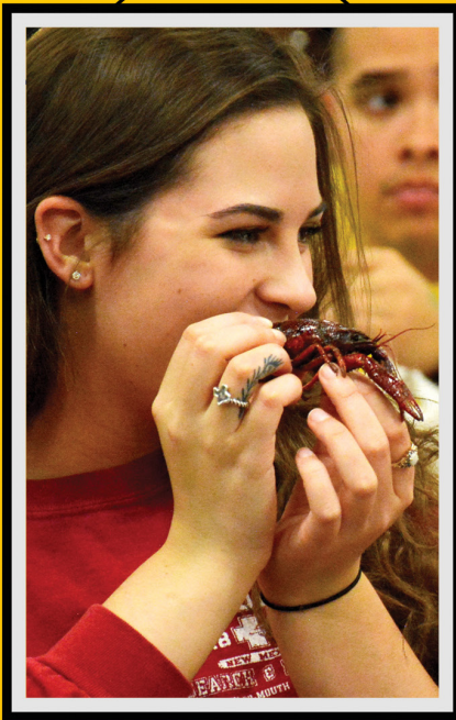
Cajun Fest May 13