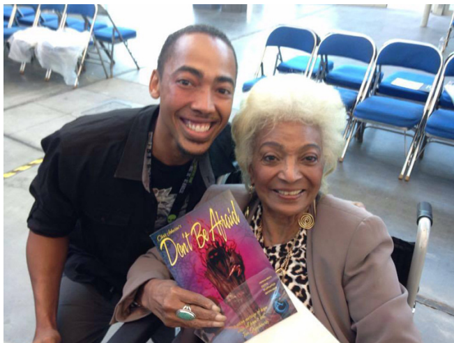
Nichelle Nichols, Uhura from Star Trek