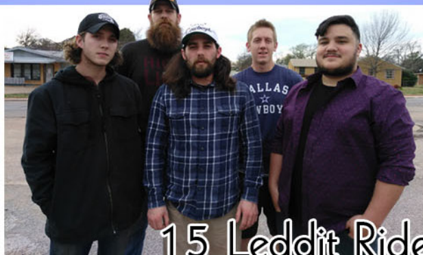
15 Ledit Ride