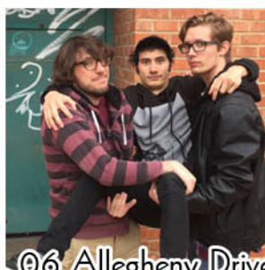
06 Allegheny Drive