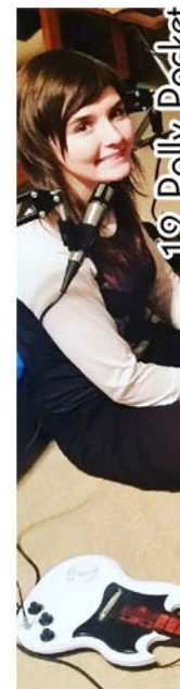
12 Polly Pocket