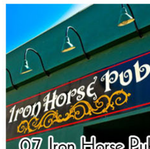
07 Iron Horse Pub